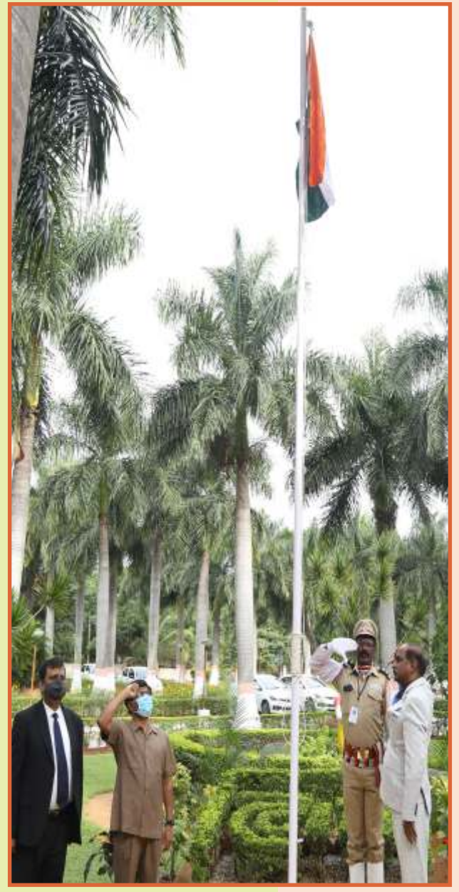
ITI Limited Celebrates 76<sup>th</sup> Independence Day

वैश्विक संचार के लिए संपूर्ण समाधान Total Solutions for Global Communications